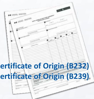
NAFTA Certificate of Origin (B232) Non-NAFTA Certificate of Origin (B239)

Bill of Lading – The primary document used by a shipper to procure transportation services from commercial carriers. Please indicate the type of clearance preferred by the consignee and the name of the Customs Broker or their appointed agent(s) at the frontier port or inland surferance warehouse.